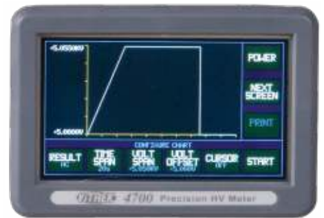
Chart Mode automatically plots voltage readings from a few seconds to several days. Highly useful for determining ramp linearity, overshoot and sag on hipot testers and other HV sources.

Automate your HV test requirement with the 4700's built-in Ethernet port, high speed serial communication port or available GPIB. The 4700 is fully programmable—so you can select your measurement mode and bandwidth, then take readings as often as desired. The 4700 also comes standard with a USB printer port, to capture readings and get hardcopy printouts of HV plots—so you can document the sag or overshoot in a typical hipot test.