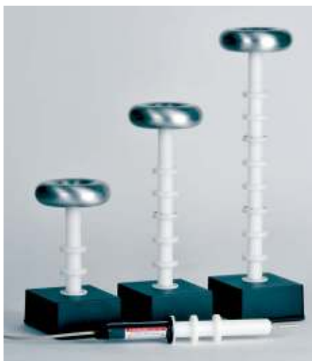
HVL Series High Performance Lab Grade, HV-SmartProbes™ shown above in 35KV, 70KV and 100KV models. Handheld HVP-35 portable HV-SmartProbes™ shown with detachable probe tip.

Vitretek's 4700 precisely measures voltages directly up to 10KV, right out of the box—with no external probes. That's high enough for most of the HV sources out there. However, should you care to expand your high voltage measurement range—just add one or more of the available 35KV, 70KV, 100KV and 150KV SmartProbes™. The Vitretek SmartProbes™ each store their own calibration data which is downloaded when they are plugged in to the 4700—this results in high accuracy, calibrated readings and allows any Vitretek SmartProbe™ to be used with any 4700 HV Meter. The SmartProbe's™ proprietary, ultra-low TC attenuator design minimizes self-heating—while its low capacitance technology enhances AC