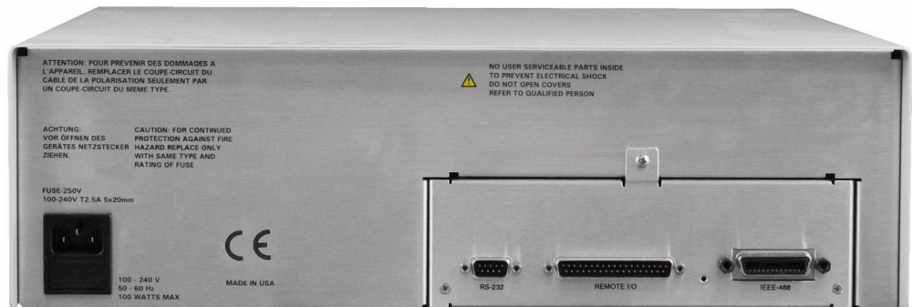
1900 Rear Connectors

Measurement results can vary substantially based solely on the source impedance of the test instrument being used. To compare measurements made on other test instruments, the 1900 series can have its source impedance set at 5, 25, 50 or 100 Ω.