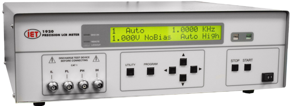
1900 Series Precision LCR Meter

The 1900 series consists of high-performance LCR Meters designed to perform fast, automated impedance measurements on a variety of electronic components and materials. These meters have a basic accuracy specification of 0.1% for accurate test results over a wide frequency range, from 20 Hz to 1 MHz. Besides their 15 impedance parameters, the 1900 meters are also capable of measuring dc resistance as well as monitoring the voltage or current in the device under test. The units incorporate a distinctive sequence test mode, allowing up to 6 uniquely different tests to be performed quickly on a single start command. Additionally, these meters include IEEE-488, RS-232, and handler interfaces, all standard.