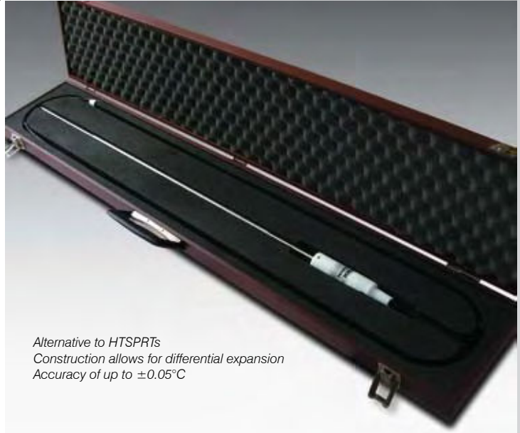
Alternative to HTSPRTs Construction allows for differential expansion Accuracy of up to ±0.05°C